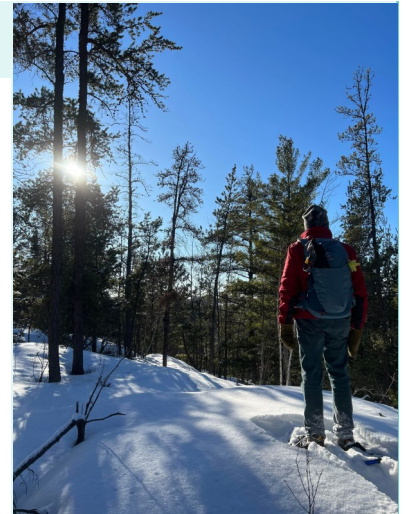
Snowshoe Trek